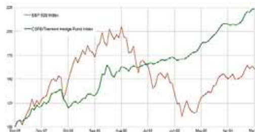
S&P500 vs CSFB Tremont Hedge Index Cumulative Growth – January 1997 - March 2005

should be aiming to do at least as well as US Treasuries, irrespective of market conditions. This is achieved by shorting securities, as well as going long, and by exploiting arbitrage opportunities in markets. Hedge funds claim to be able to preserve their investors' capital by making a positive return – or at least losing less money than long only funds when markets are performing poorly.